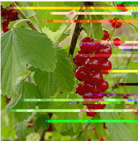
Ribes rubrum Pallas.

Currants are a rich source of antioxidants, a group of biochemicals shown to be an important part of the human diet. They are a good source of manganese and potassium.